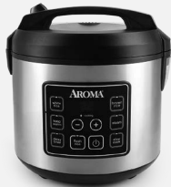
Digital Rice & Grain Multicookers