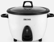
Rice & Grain Cookers